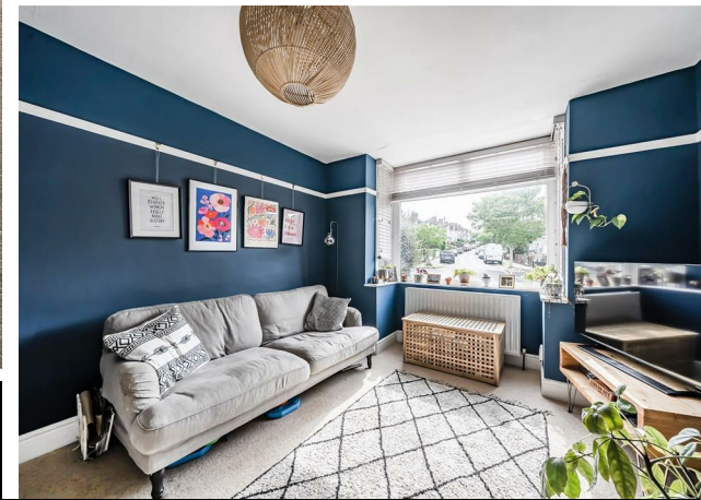
Beechmount Grove, Hengrove